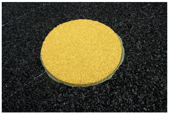
Weight down the graphic if needed. After sticking the glue must be always little squeezed out of graphic edge.