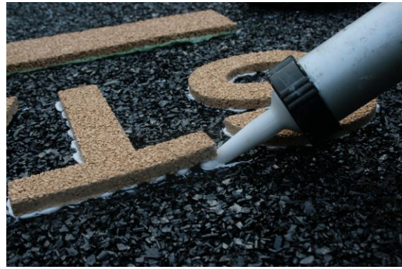
To stick small graphics use one-component glue. It is also convenient for small repairs or fixing.