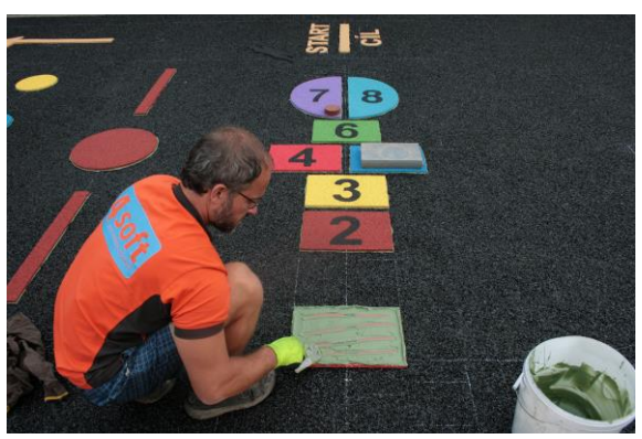
Spread glue evenly on underside of your graphic.