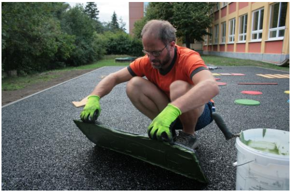
TAKE CARE ABOUT UPPER SIDE OF GRAPHIC COMPONENT TO AVOID STAIN OF GLUE ON IT !!!