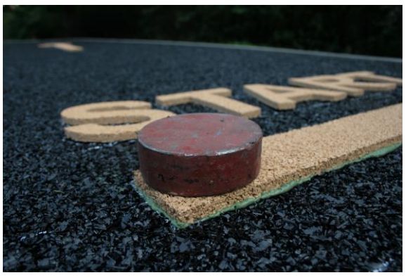
Weight down the graphic if needed (sometimes the edges of graphic component might stick out).