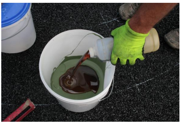
Mix properly two component glue (can be ordered together with graphics). Use standard PU glue for artificial grass. Two component glue, use for bigger patterns or more graphics.