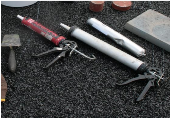
To stick small graphics use one-component glue in cartridges or salami. For example Proline T44 or Extrem FIX.