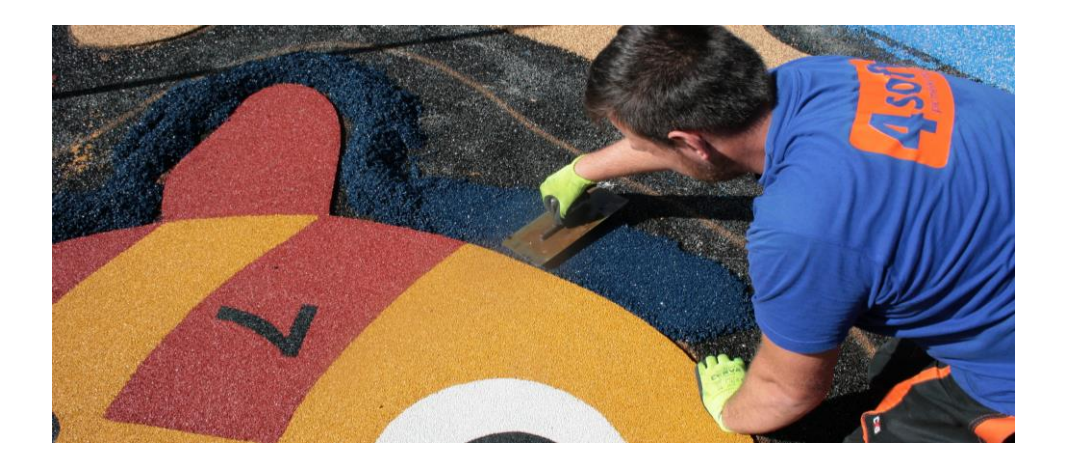
Spread and compress properly your final EPDM coat around the component.