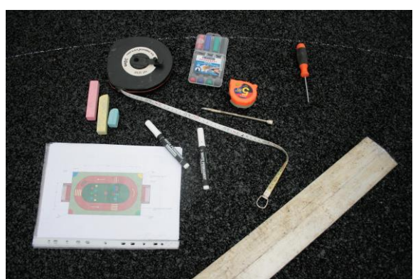
Needed tools to measure out requested graphic.