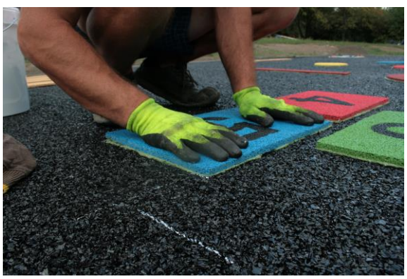
Place graphic exactly and press properly to improve the glue distribution.