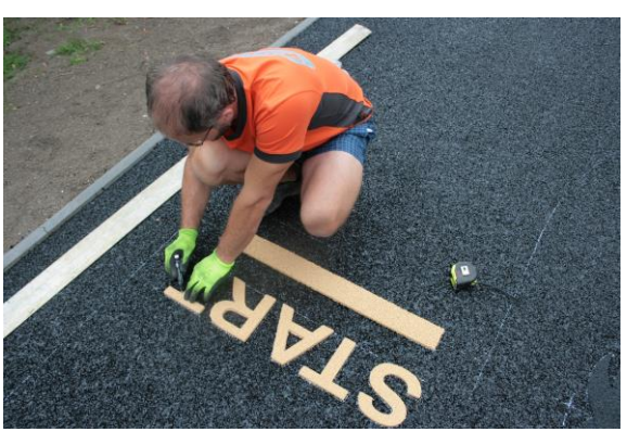
Measure out and copy graphic on cured SBR layer along with requested design.