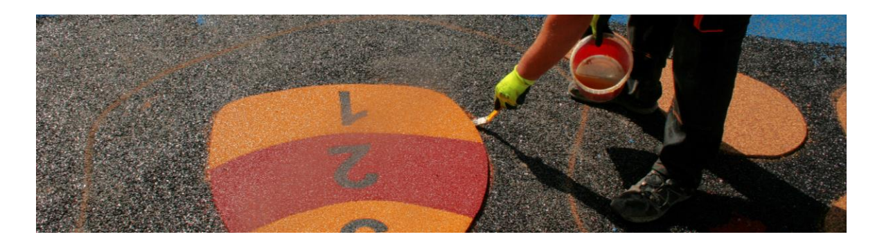
Apply the thick binder on outside edges of component to avoid edge separation from the rest of the EPDM on the top layer. TAKE CARE ABOUT UPPER SIDE OF COMPONENT TO AVOID STAIN OF YELLOWING BINDER ON IT!