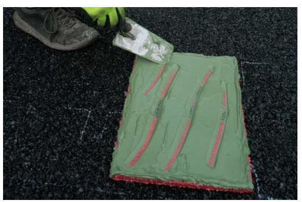
Make sure the glue is spread evenly and to the edge !!!